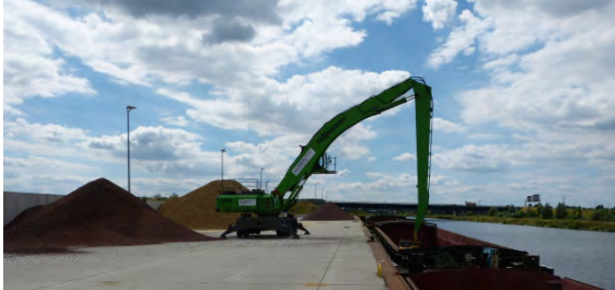
Port Wustermark „HavelPort“

The federal state of Brandenburg is by far the state with the largest area of water and has a dense, efficient waterway network with a multitude of inland ports that have to be used more strongly for the freight shipping.